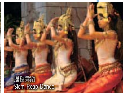
暹羅舞蹈 Siem Reap Dance