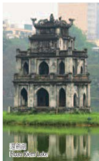
還劍湖 Hoan Kiem Lake

Full day city tour in Nha Trang will include Tri Nguyen aquarium on Mieu Island. Lunch will be served on Con Se Tre Island, after which all will proceed to visit fishing villages. Later on one can leisurely stroll at Vin Pearl Land (the entertainment palace). Depart by flight for Ho Chi Minh City. Dinner at a local restaurant. (B/L/D)