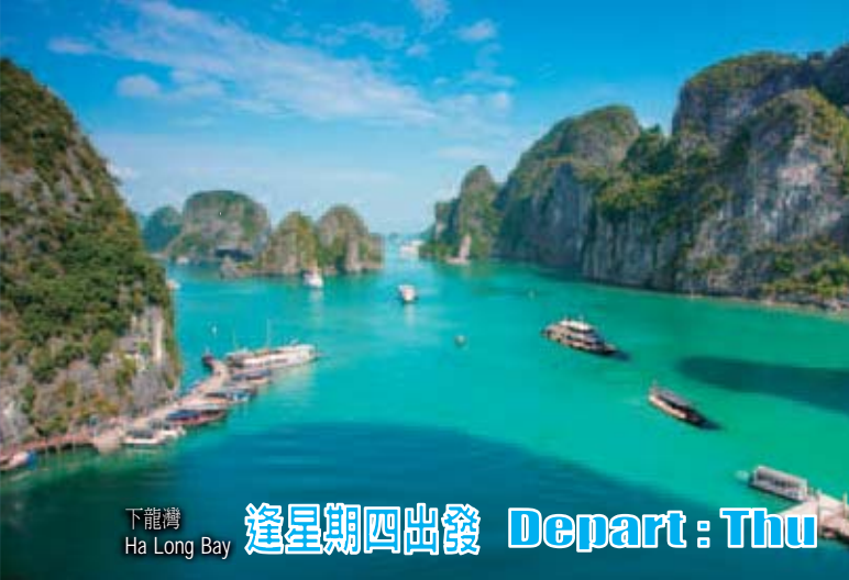
下龍灣 Ha Long Bay