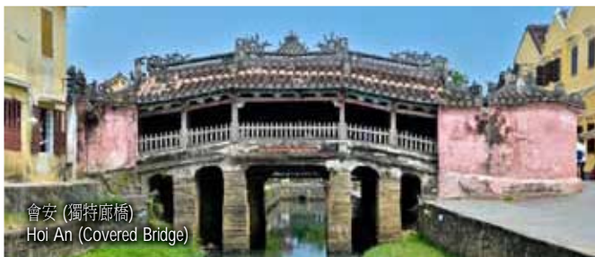
會安(獨特廊橋) Hoi An (Covered Bridge)

住宿：Pullman Hotel 或同級 (晚餐) Arrive in Hanoi, the political and cultural center of Vietnam. Visits will be made to Tran Quoc Pagoda, Hoan Kiem Lake, Den Ngoc Temple, Temple of Literature etc. In the evening, enjoy the world's famous water puppet show. Dinner at a local restaurant. (D)