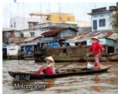
湄公河 Mekong River