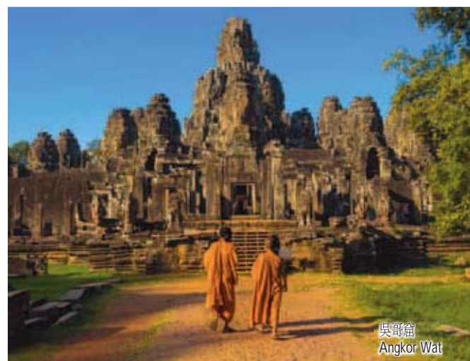
吳哥窟 Angkor Wat

After breakfast, visits will be made to the 7 Wonders of the World, Angkor Wat and Angkor Thom. With weather permitting, all will enjoy the breath-taking sunset at Angkor Wat. Lunch and dinner at local restaurants. (B/L/D)